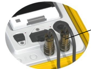
Push-pull Quick Connector